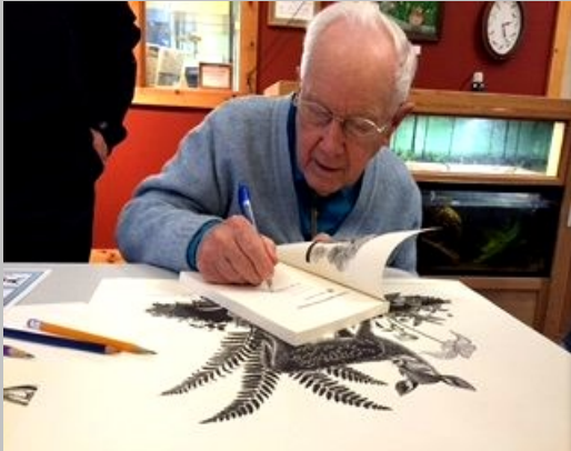
Nature's Quiet Conversations