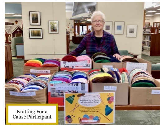
Knitting For a Cause Participant