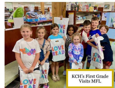
KCH's First Grade Visits MFL