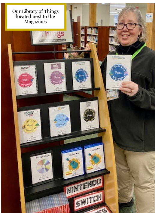
Our Library of Things located next to the Magazines