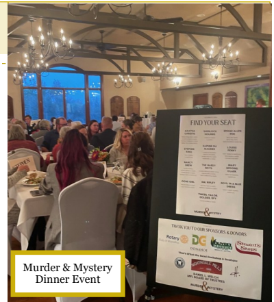
Murder & Mystery Dinner Event

In 2024, library patrons borrowed more materials compared to 2023, reflecting a 3.7% overall increase in borrowing activity. Our digital checkouts also saw significant growth: Libby, experienced a 27% rise in usage from 2023, while Hoopla saw an increase of 17%.