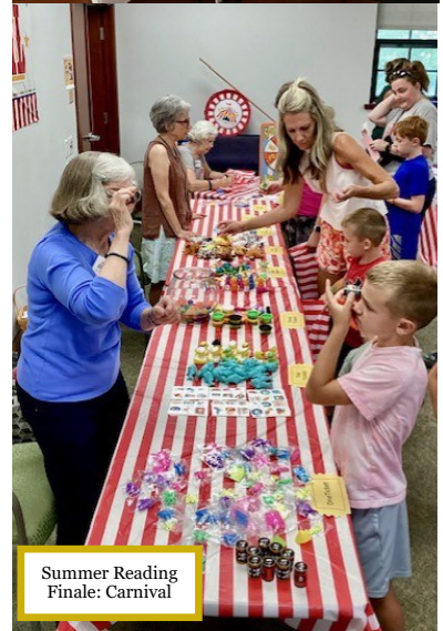
Summer Reading Finale: Carnival